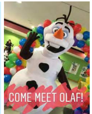
Disney Soc Best Society Event Campus Fun Day