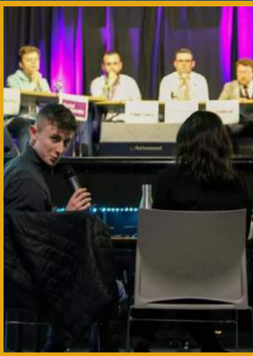
Literary & Debating Society.

Several members of our Committee moderated a fantastic debate between all of the student-led political parties in Maynooth University. The event was hosted less than a week before the Irish General Election 2020, and attracted a crowd of over 200 students to the MSU Venue. The debate was an excellent opportunity, allowing the Society to broaden MU students' awareness of each political party's platform in advance of a crucial general election. It most definitely stands as our highlight of the year.