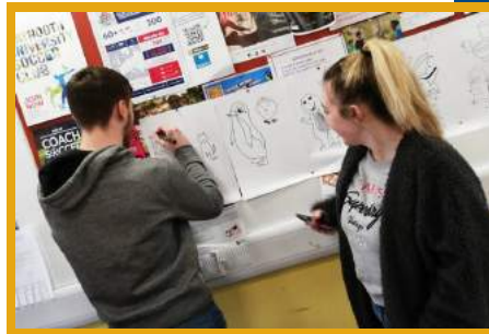
Christmas Craft Fair. Arts, Crafts & Design Society.