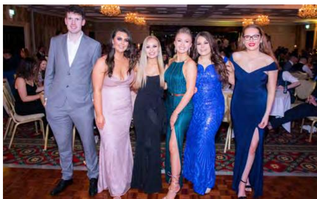
Business Soc MSU Charity Champion