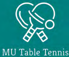
Table Tennis Club Club Most Improved